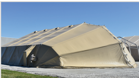
Tri-lid Door (Full-Width Aircraft Door)