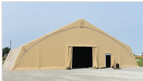
Gable End with Fabric Vehicle Door and Personnel door