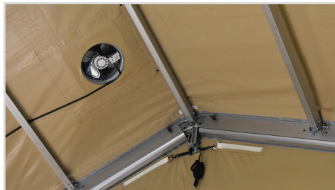
Ventilators (External/Electric Roof Ventilator)