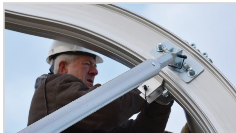
Locking purlins provide enhanced stability across the shelter