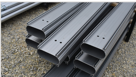
Standard beam design, including integrated keder track