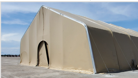
Gable end walls provide supports for personnel doors and entry ways

*Camouflage green 483 fabric color options available for all LAMS shelters. Standard sizes listed LAMS attributes can be modified at the customer's request to provide shelters to match any need.