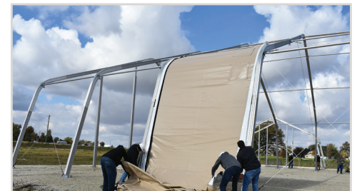
Keder fabric panels install quickly and easily