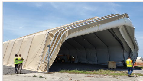
Tri-lid doors allow for maximum clearance when entering the shelter