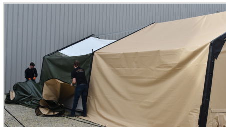
Shelter body panel installation