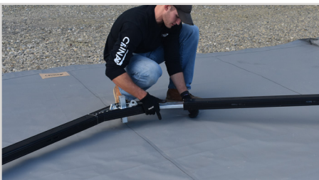
Anodized aluminum frame