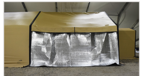
Bubble foil radiant barrier (*optional)