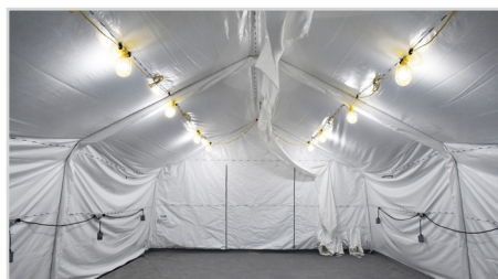
Plenum, lighting, and power receptacles