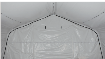
Internal white liner